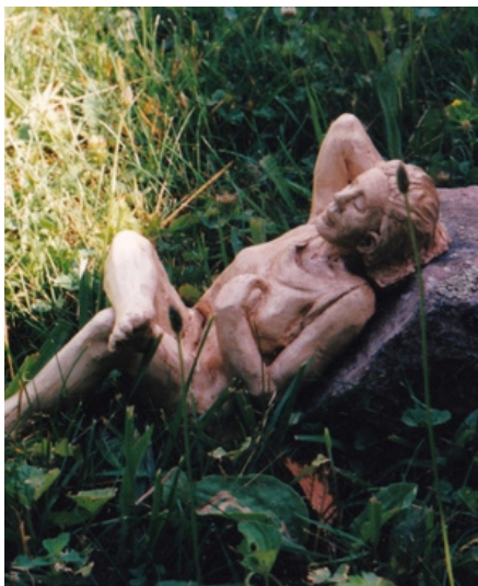
ARTIST: PAM MCCOWEN