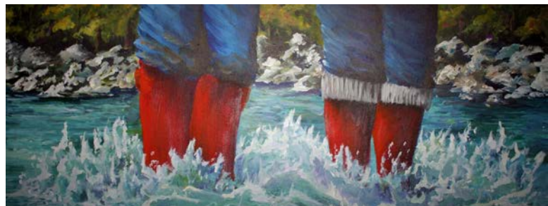
Big Splash by Leona Kennedy