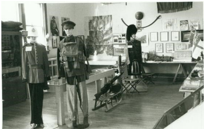
Interior Clarksburg Military Museum, by A. Black

Together we share the individual stories of our neighbours, friends and family members who were involved in our military heritage from the 19th century to today. In addition, local military organizations, such as the Clarksburg Military Museum, the Royal Canadian Legion Beaver Valley and secondary resources will be included. It will continue to grow and expand as we collect and document this history providing community resources for digital access around the world.