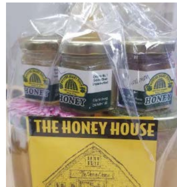
Gift Bag from the Honey House