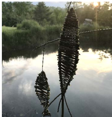
Basketweaving Workshop with Blue Mountains Baskets