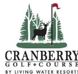
10 day Family Pass