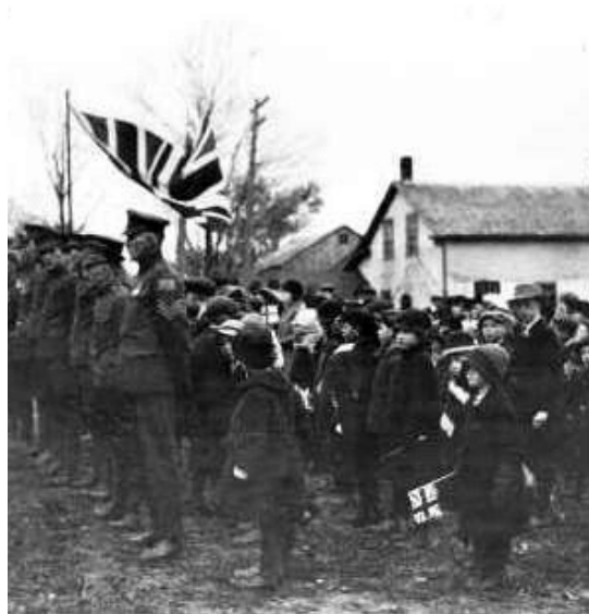
RAVENNA, REMEMBRANCE DAY. 1921

Come in to the Craigleith Heritage Depot or L.E. Shore Memorial Library to write a postcard to a veteran / service person, and then add it to our Peace Wreath or mail it to an address provided by a staff member through the Veterans' Affairs Canada database.